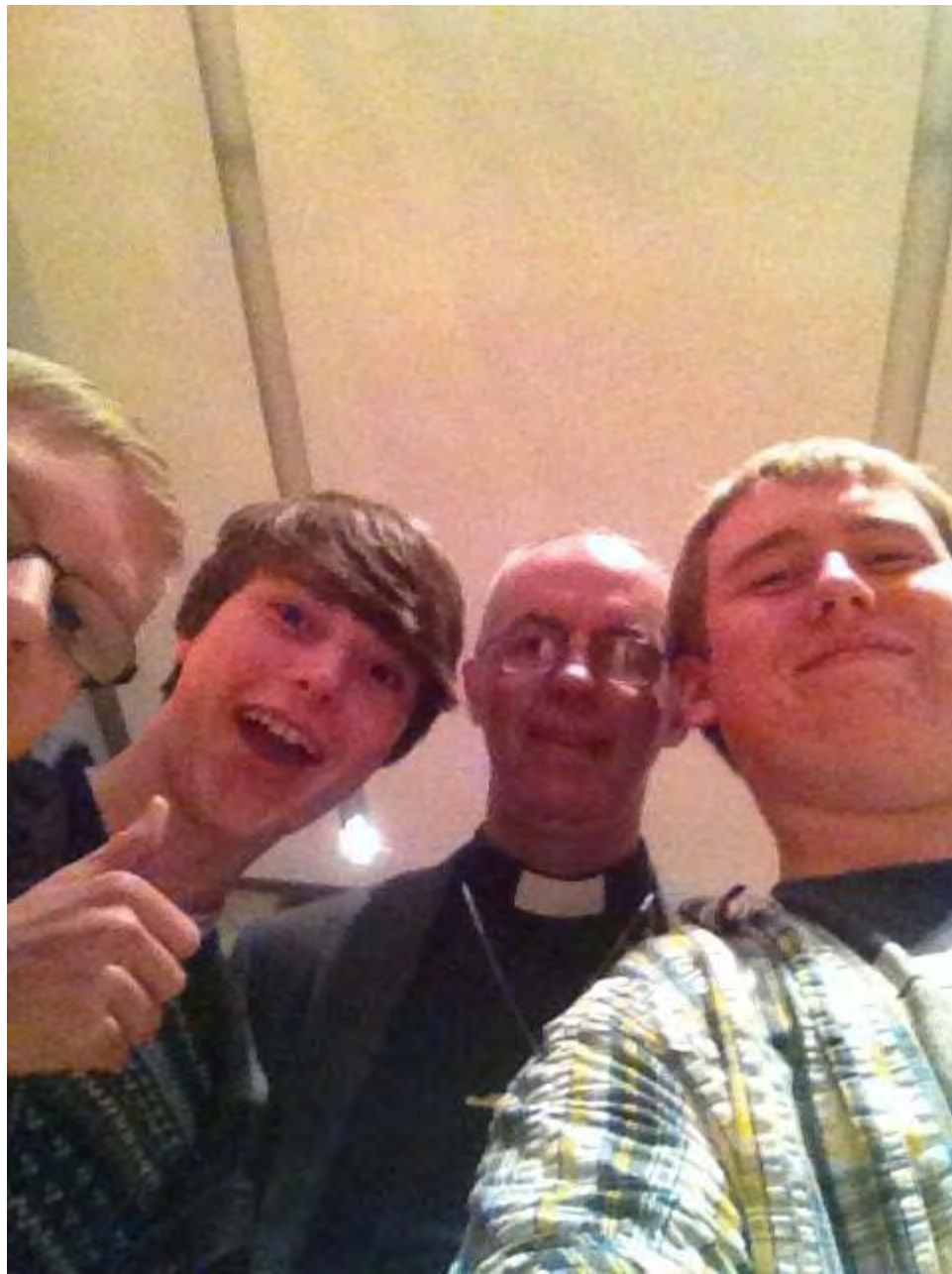
Three members of The Edge, the village's church youth group, take a selfie with the Rt Hon Justin Welby, Archbishop of Canterbury, last year.

Many thanks to all who supported the recent Family Quiz Night. £770 was raised which will be used for Youth Work with the village churches.