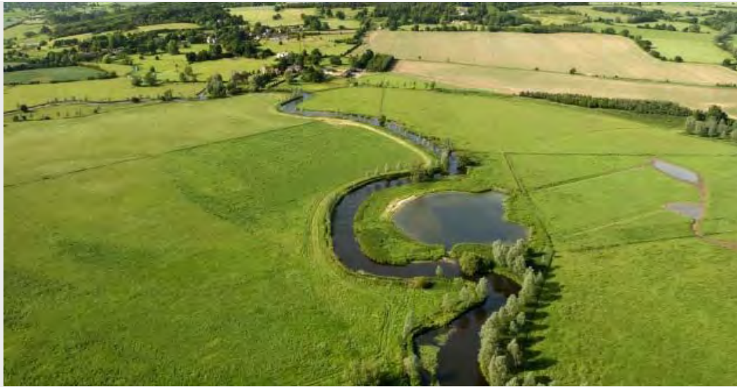
(Valley Floor Dedham Vale AONB)

Dedham Vale AONB and Stour Valley Forum Conference 2014