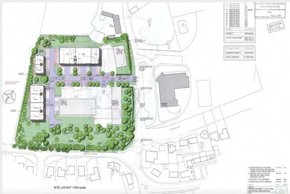
Planning application for industrial development on Hill Farm that was passed in 2007

http://www.planning.colchester.gov.uk/WAM/showCaseFile.do;jsessionid=8ED083B5F1F75E56CC40E7E3EE482A96?action=show&appType=Planning&appNumber=072382