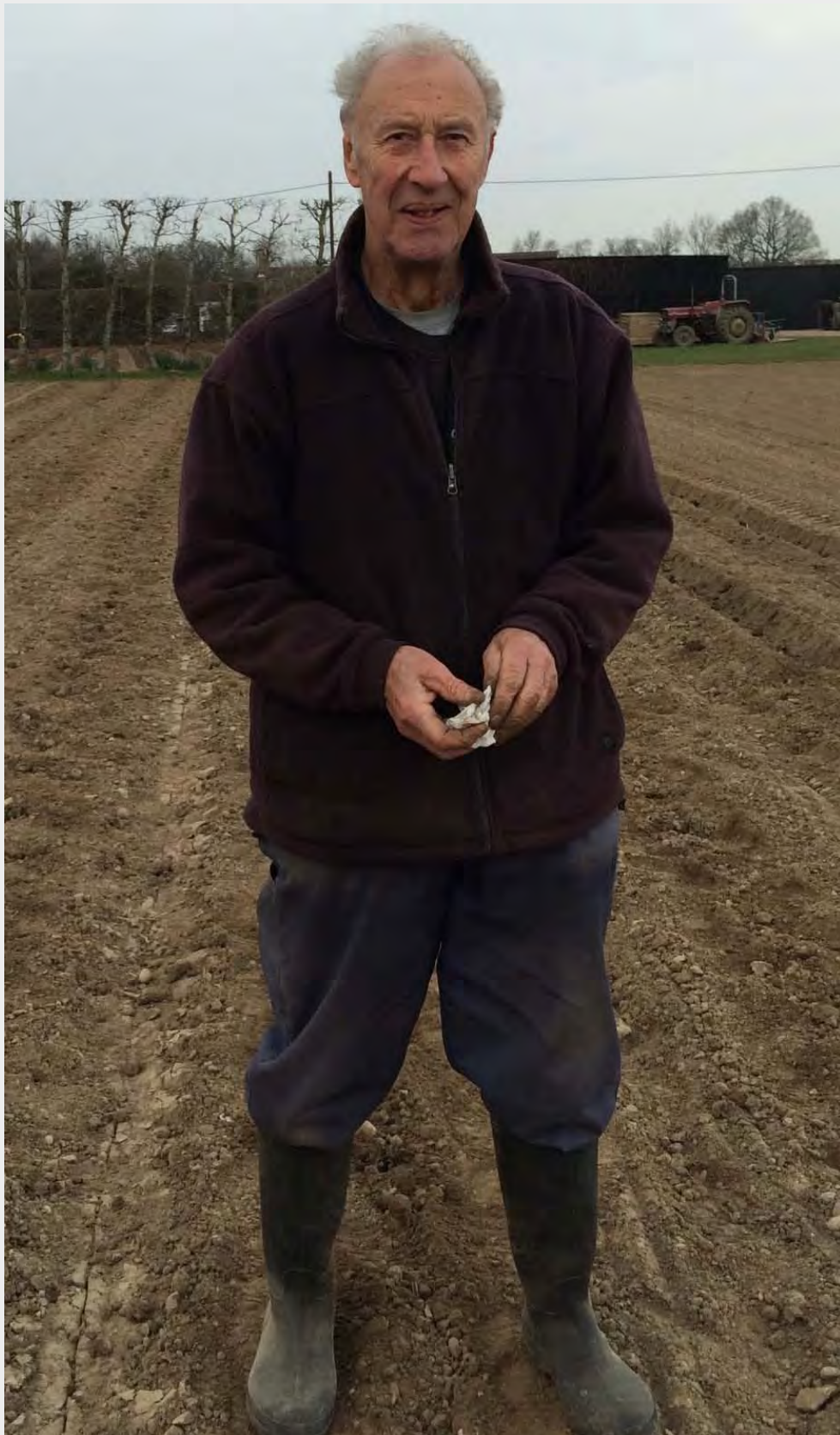
Faces of the Village