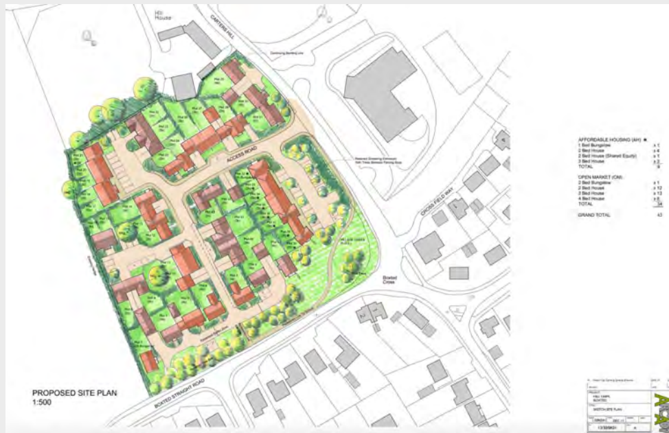
Planning application for residential development on Hill Farm that was lost on appeal in 2014.

http://www.planning.colchester.gov.uk/WAM/showCaseFile.do;jsessionid=8ED083B5F1F75E56CC40E7E3EE482A96?action=show&appType=Planning&appNumber=072382