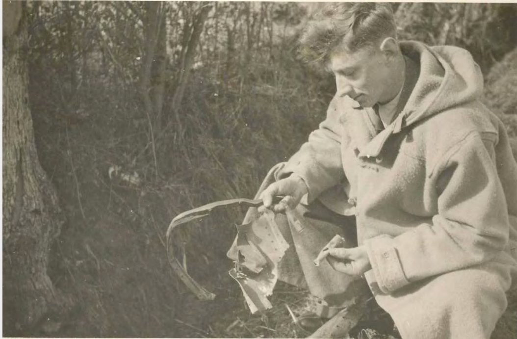
Boxted Airfield Historical Group

Boxted Methodist Silver Band is having a joint concert with 1 st Class Brass at Wimpole Road Methodist Church on March 14 th at 7.30 pm. Tickets £6 or £15 for a family ticket from Liz 01206271511 or Linda 07436116694. Traditional and modern music for all tastes.