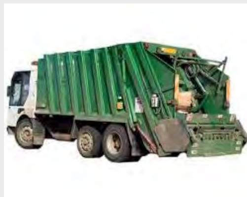
Attended Refuse Freighter

Pictured above is the seat outside Langham Church used by walkers on The Essex Way for a stop off point