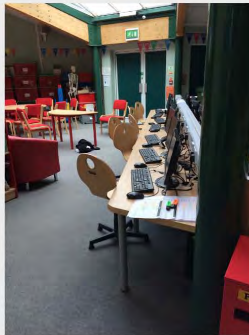
Boxted St Peter's Primary School Library and IT suite