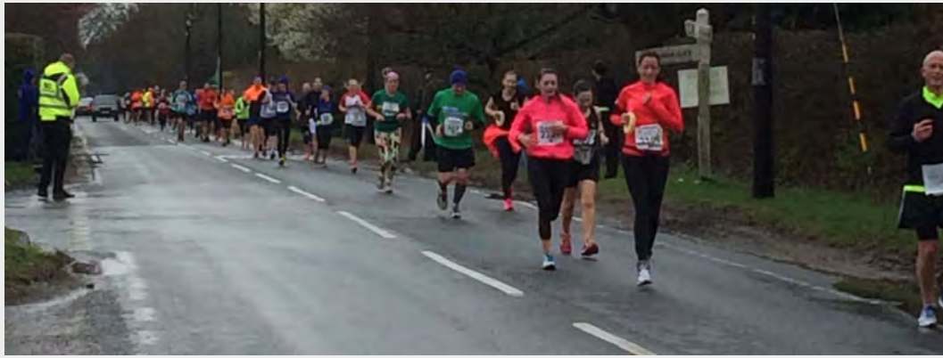
Colchester Half Marathon passing through the village recently