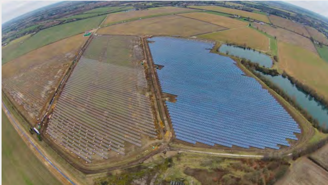
Langham Solar Park taking shape

Follow pictorial progress of the Solar Park here