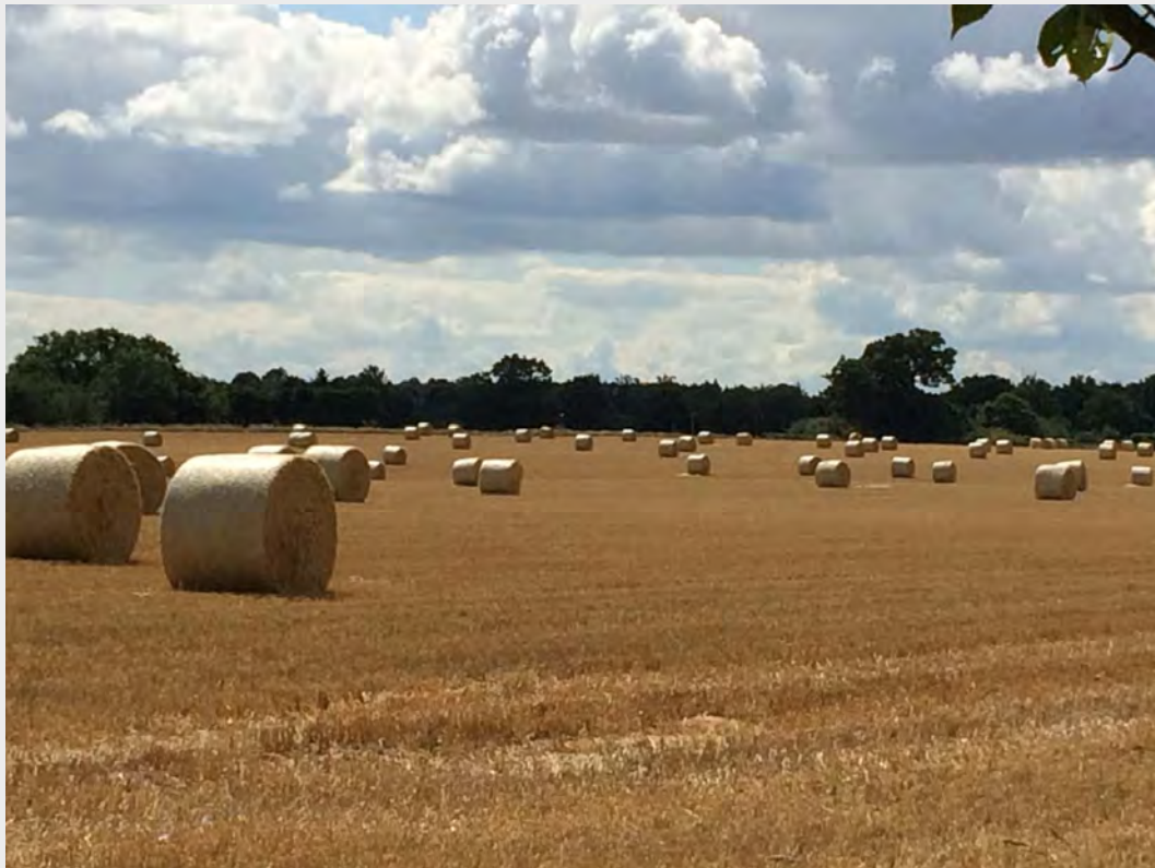
2015 Harvest looking across from Dedham Road, Langham