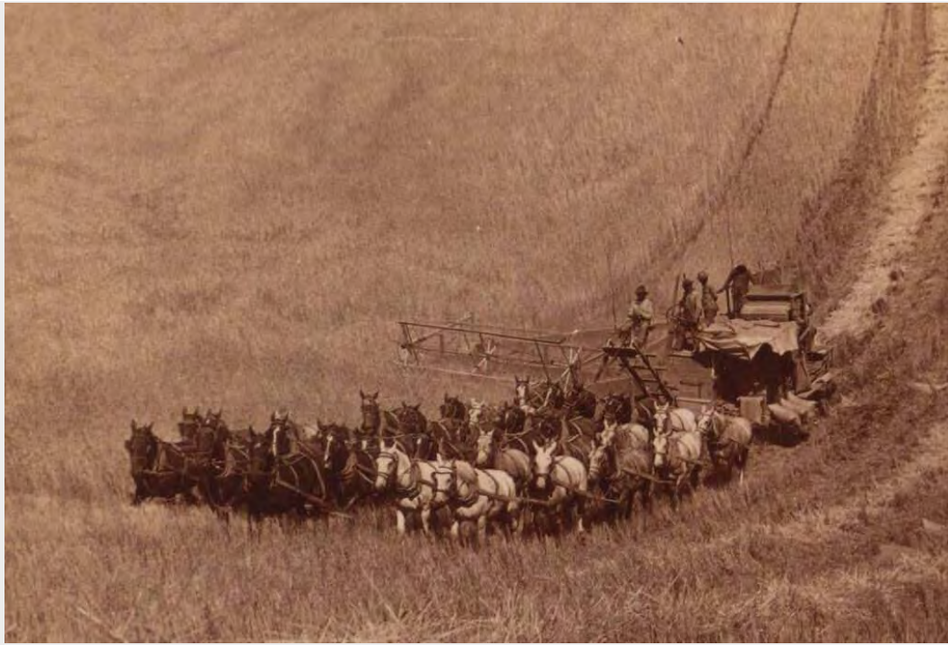
A combine harvester in 1902 being pulled by 33 horses