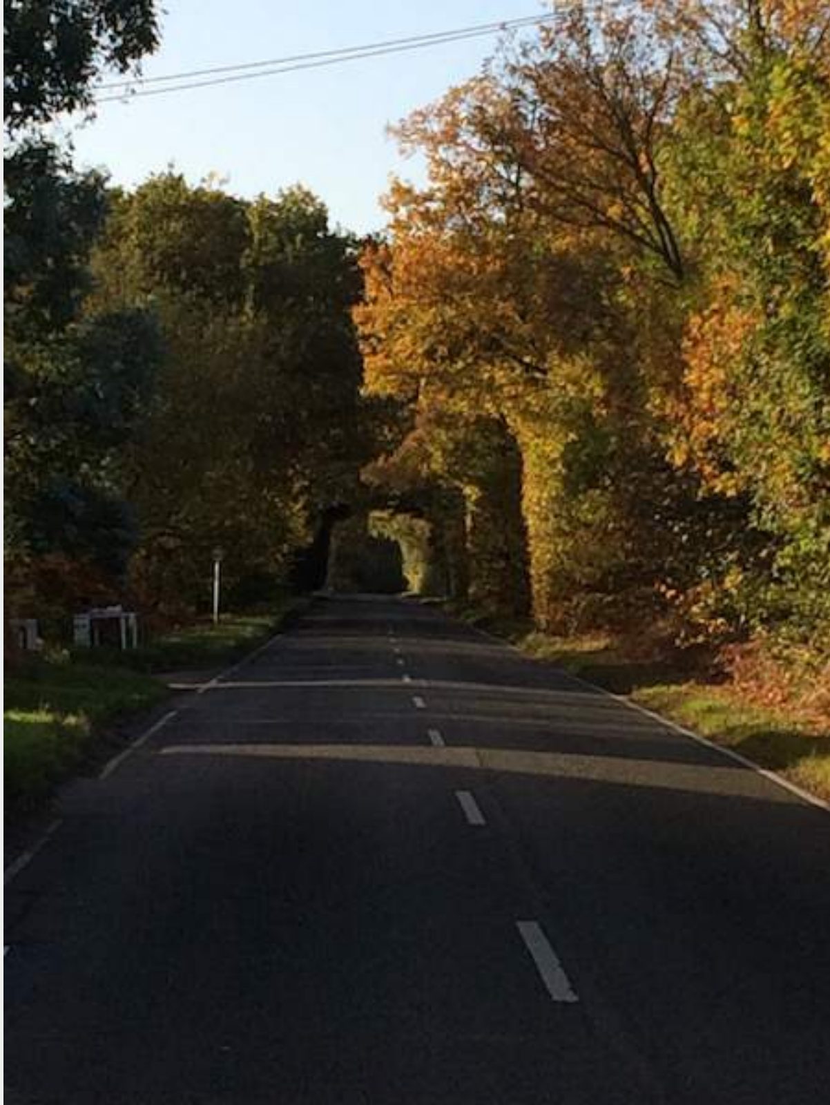
Characteristic Hawthorn and Oak hedging on Bosted Straight Road with a distinctive arch formed by passing lorries.