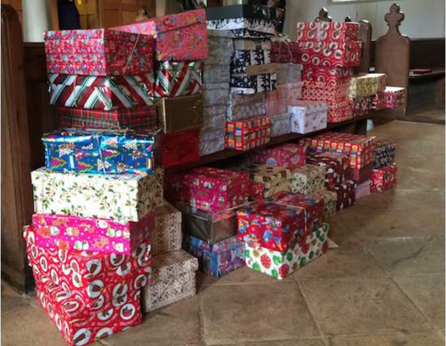
Donations of filled shoeboxes for Operation Christmas Child at Langham Church

Didn't get around to filling a shoebox? Fill a shoebox online here: