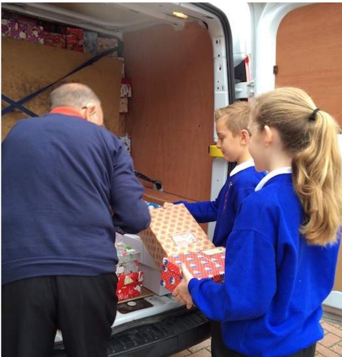
Pupils from Boxted St Peter's Primary School loading shoeboxes filled with small gifts ready to be delivered to Eastern Europe as part of Operation Christmas Child 2015

Landowners have a duty to keep their ditches clear. Leaves and other material can easily clog drainage ditches causing flooding issues not just for the landowner but also for surrounding public highways and buildings.