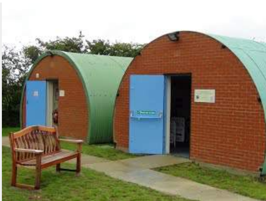
Boxted Airfield Historical Group

Evergreens Club meeting in Boxted Village Hall at 2.30 pm on Thursday 15 October from 2 30pm