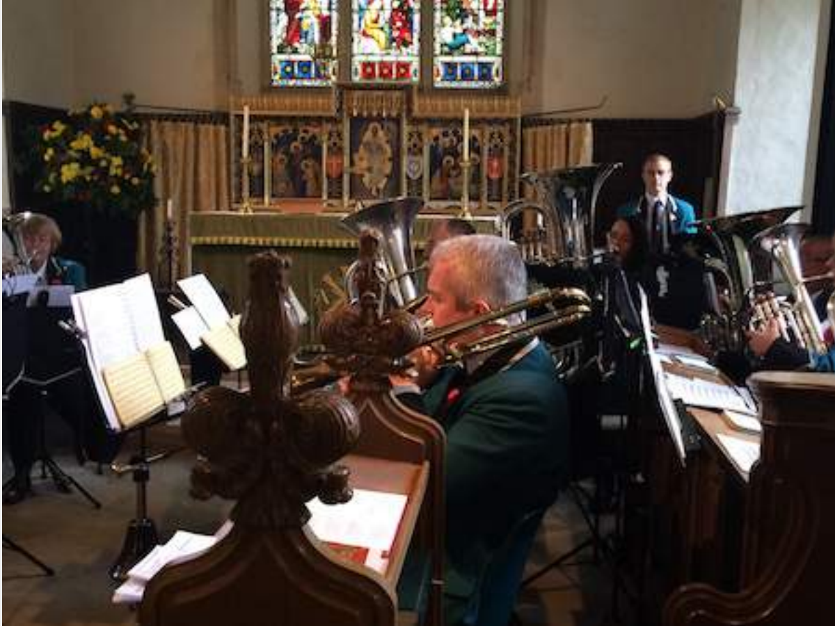
Members of Boxted Methodist Silver Band playing at the Remembrance Service in Boxted Church recently.